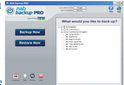
Simple, intuitive and powerful user interface with backup scheduler

NAB Backup PRO delivers reliable, cost effective, high performance and secure online backup and recovery services for entrepreneurs, small businesses or large enterprise computer servers and applications. NAB Backup PRO is built on highly reliable hardware with proven algorithms and innovative patented software to create a game-changing solution set that can scale to meet today’s most demanding business IT data protection requirements.